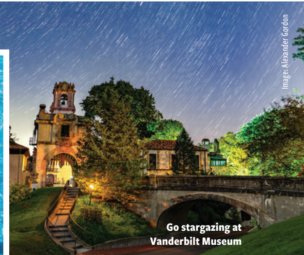
Go stargazing at Vanderbilt Museum

Become a spy for the day at the Brewster House, which was built in