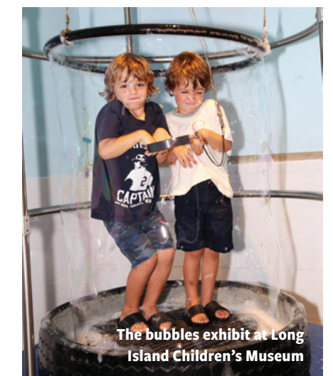
The bubbles exhibit at Long Island Children's Museum

MORE INFO: discoverlongisland.com/family