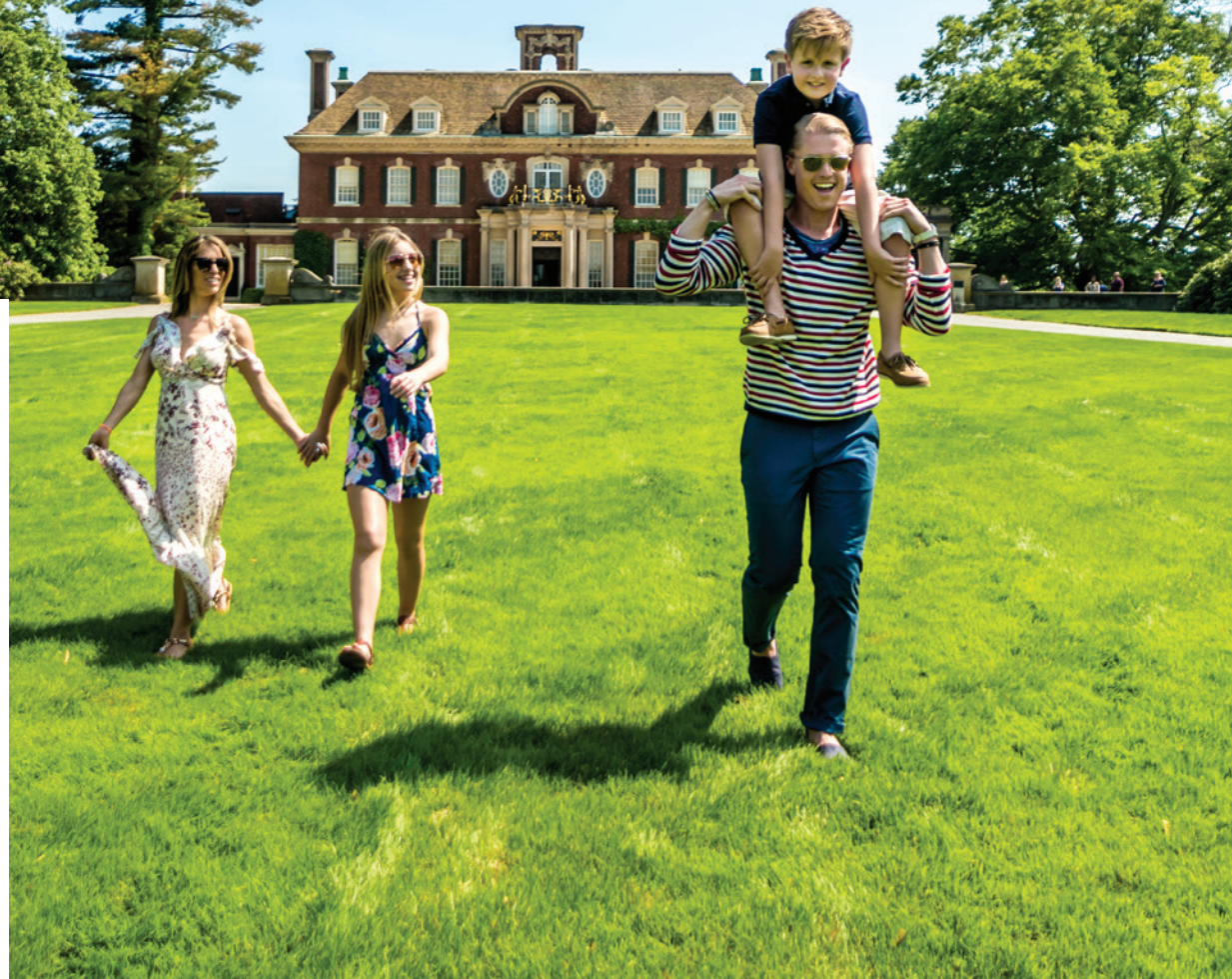
Travel back in time with a visit to Old Westbury Gardens

Housed in a former airplane hangar, the interactive and fun Long Island Children's Museum is a must for visitors with kids. Children can create and play in the bubble exhibit, learn about herbivores, carnivores and omnivores in the live animal habitat, and explore