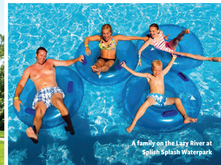
A family on the Lazy River at Splish Splash Waterpark

Planetarium and Dome Theater is home to one of the largest air and spacecraft collections in the world, taking visitors through a journey of more than 100 years of history. Experience a Lunar Module Simulator and view one of three lunar modules on display in the world, the Apollo Lunar Module 13.